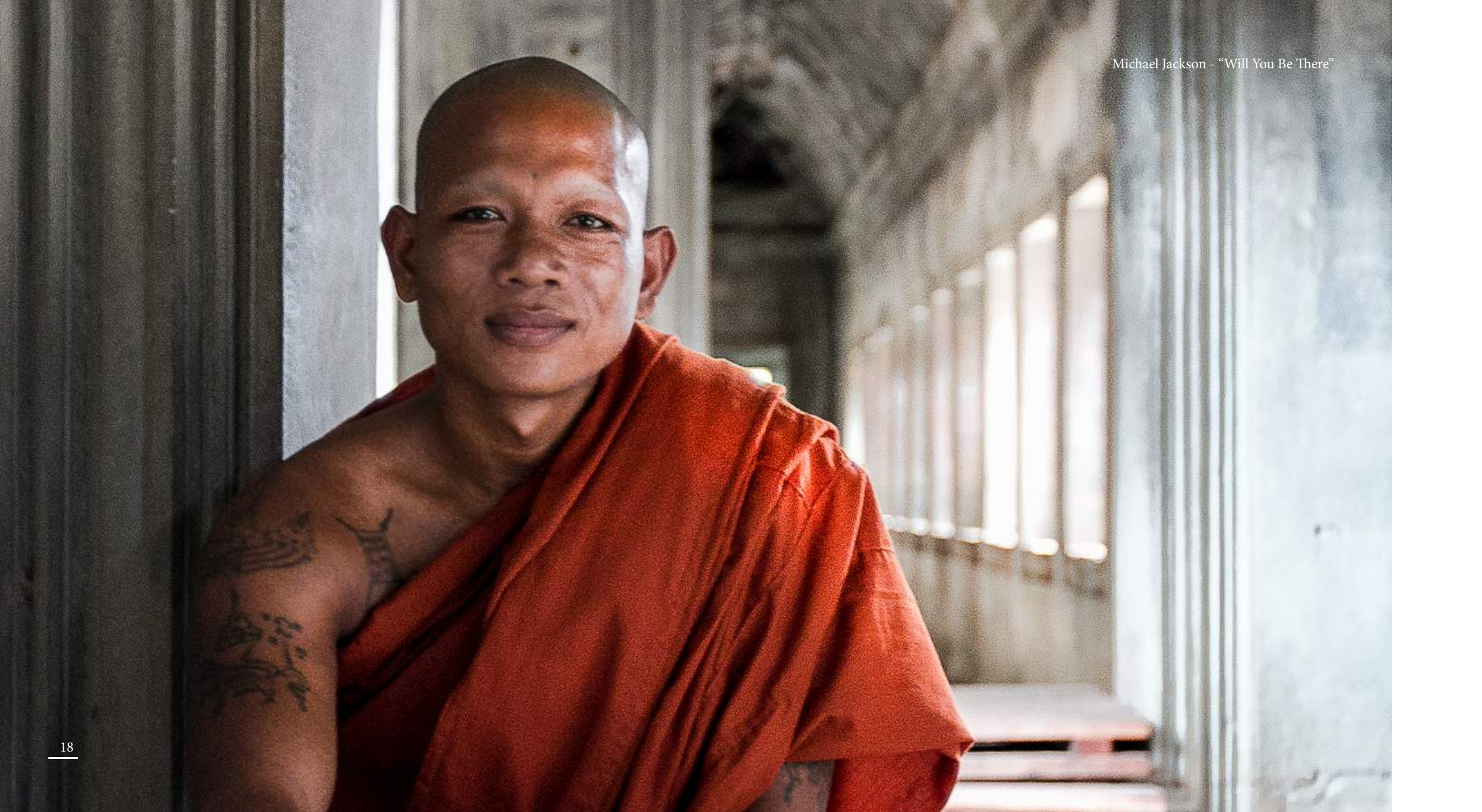
If not, —you had better do something to change it.